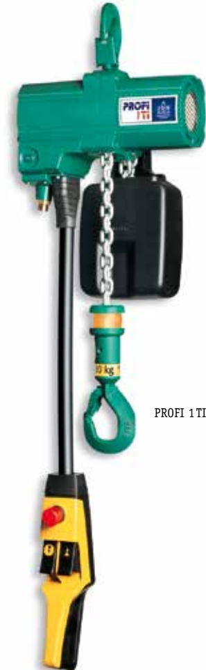
PROFI 1 TI

Group mechanism at 6 bar: PROFI 025 TI M5 (2 m), PROFI 05 TI - PROFI 2 TI M4 (1 Am)